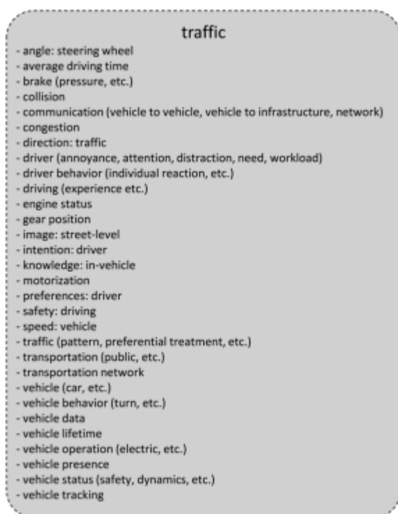
Fig. 2. Domain-specific context cluster for the traffic domain

that we have identified do not represent context within the respective domains exhaustively; they constitute just excerpts of the domains as discussed in the analyzed papers. Second, despite being careful about establishing intersubjective validity when consolidating the context elements (see Section 3.3), different approaches of consolidating could lead to a different categorization. Still, as the high-level context categories (generic and domain-specific context as well as social, technology and physical context) remained stable throughout our analysis, we do not expect that different approaches to consolidation on lower context levels would considerably change our results.